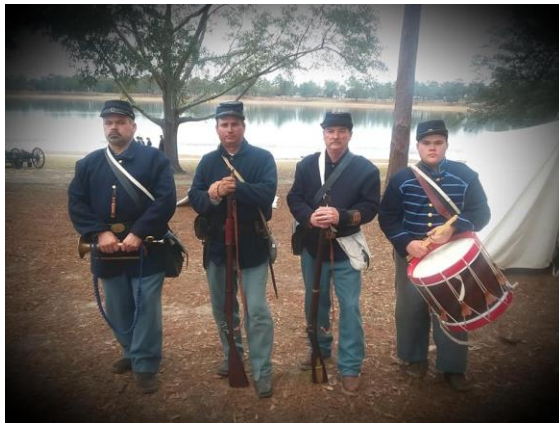
Members of the 9 th Connecticut Infantry pose for this photo at DeFuniak Springs before battle formation.