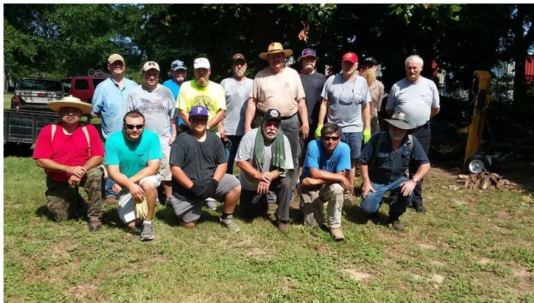
Camp Members and participants all took a photo in front of the wood splitters during a water break.