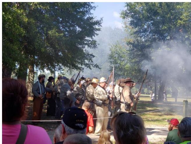
The Shieldsboro Rifles in battle on Saturday giving the Yankees the hot lead at Beauvoir October 19, 2019.