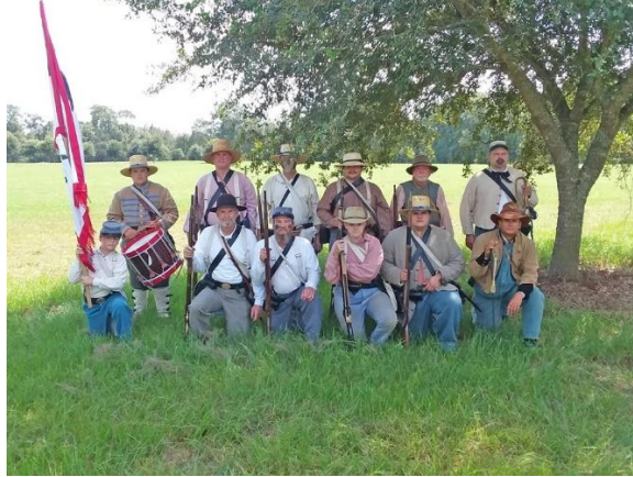
The Shieldsboro Rifles formed up for battle at the John Ford Home on September 14, 2019.