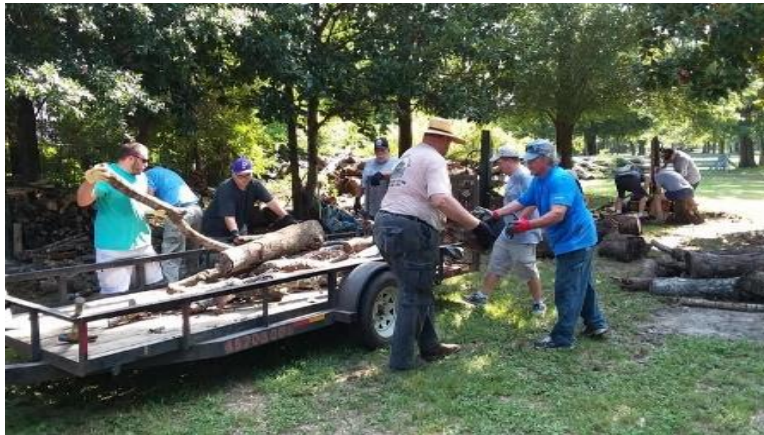
The volunteers were able to cut, split and stack all firewood needed for this year's Fall Muster Event.