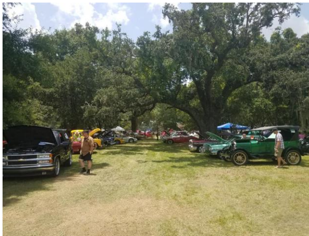
The classic cars were lined up in row after row in the West Field under the trees at Beauvoir on July 6, 2019.