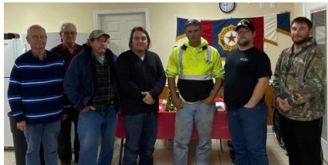
Camp Members take a photo at the end of the meeting at the American Legion in the Bay.