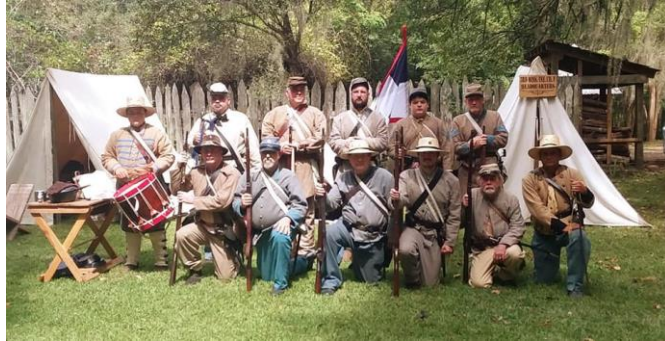
The 3 rd Mississippi Infantry attended the Reenactment at the Oakley Plantation in St. Francisville, LA.