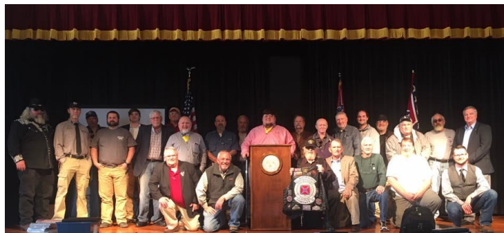
The Compatriots who attended the Division Workshop at the War Memorial Building posed for a photo.