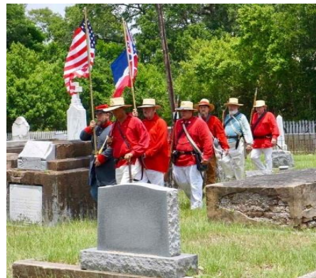
Camp Members marched in to post colors at the Cuevas Memorial at the Biloxi City Cemetery.