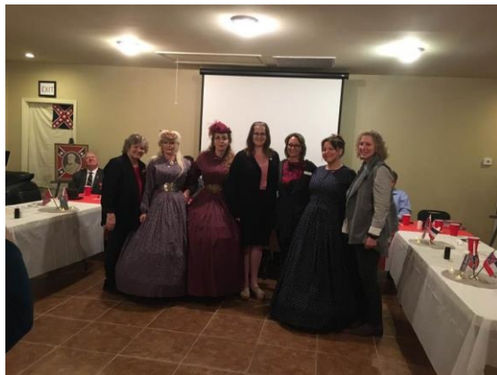
The OCR Members in Attendance at the Lee-Jackson Banquet at the Mercy House in Waveland.