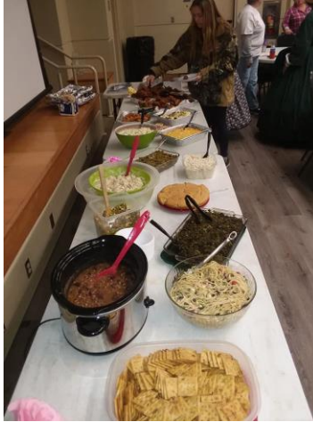
There was a nice spread of food at the Confederate Flag Day Event at Beauvoir Saturday March 7, 2020.