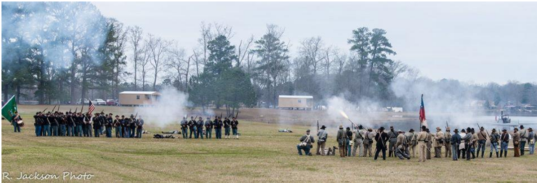
The Battle for the Texas Hospital rages on at Achusa Creek Park on Saturday February 22, 2020.