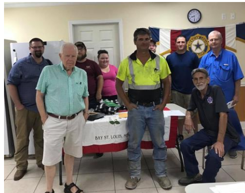
The Shieldsboro Rifles and guests took a photo after the meeting was over after a good presentation.