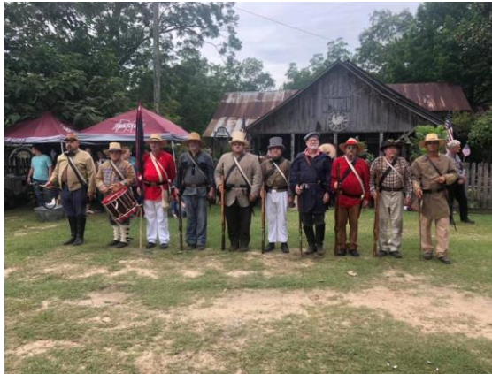
The 3 rd Mississippi Infantry formed up to honor the veterans on July 20, 2019 near Poplarville.