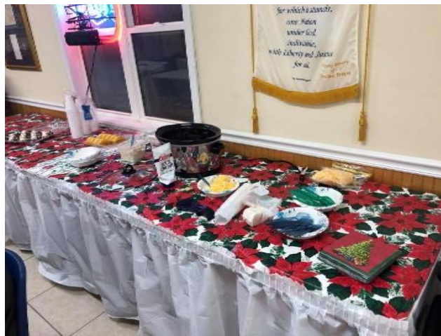
The OCR Chapter helped provide a Christmas Dinner Celebration on December 17 th , 2019.