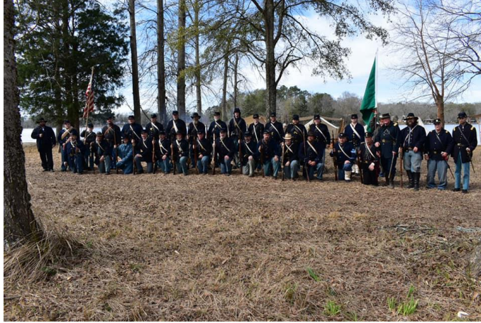
Camp #2263 Members formed up with the 9 th Conn. Inf. of the Gulf Coast Battalion at Quitman.