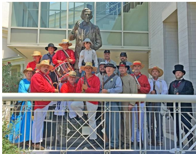
The participants all took a photo around the Jefferson Davis statue at the end of the ceremony.