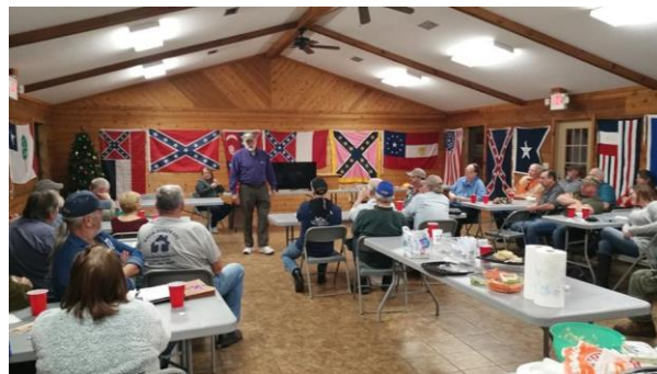
The Shieldsboro Rifles were represented at the 5 th Brigade Meeting with the other Camps in attendance.