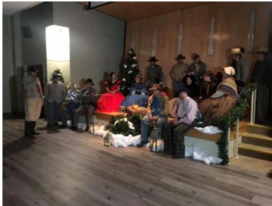
The "Beauvoir Players" prepare for the skit in the Beauvoir Room of the JDPL at Beauvoir.