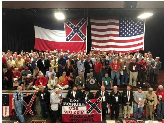
Division Members who attended the Reunion in Brandon took this photo at the end of the meeting.