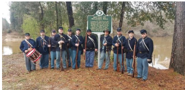
The 3 rd Miss. Inf. posed for this photo before battle on Saturday as the 9 th Conn. Inf. at McLeod's Mill.