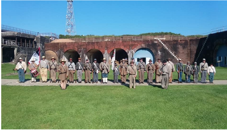
Camp Members attended the Annual Commemoration of the Battle of Mobile Bay at Fort Morgan.