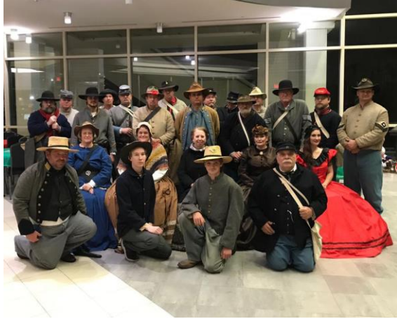
Camp Members pose for a photo before the Christmas in Camp event in the JDPL Dec 21, 2019.