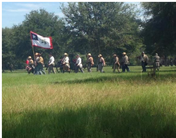
The Shieldsboro Rifles took the field for battle with the regimental flag flying in the breeze.