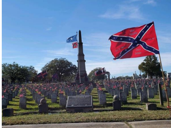
Camp #11 Raphael Semmes Camp held their annual Lee-Jackson Salute on Sunday January 19, 2020.