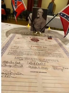
The Pearl Rivers Chapter #30 of the Order of Confederate Rose was chartered Jan. 18, 2020.