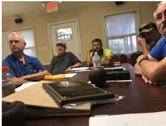
Camp Members looked on and listened to the presentation of the various tours of the Crescent City.