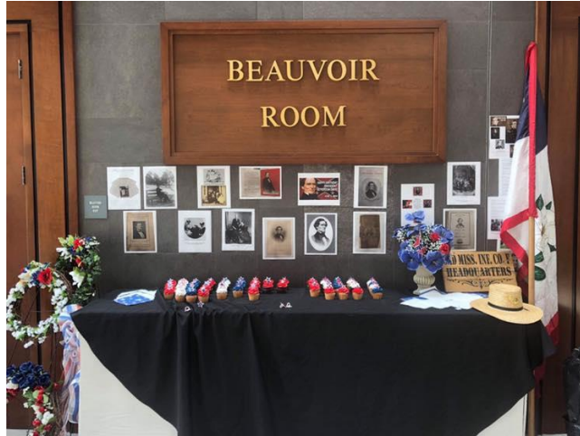
The Annual Birthday Celebration for President Jefferson Davis was held at Beauvoir on June 1, 2019 on site.