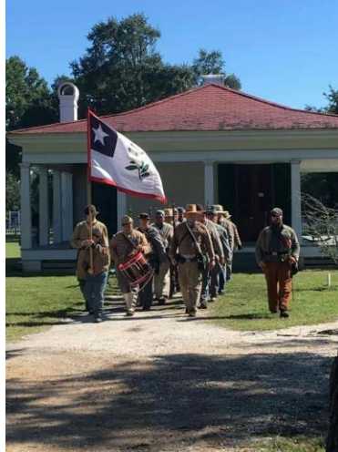
The Shieldsboro Rifles formed up for the Traveler Headstone Dedication out in front at the Beauvoir House.