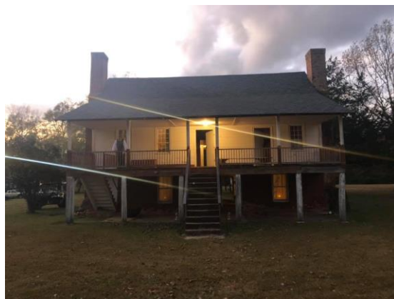
The home was all lit up for the Candlelight Tour as nightfall was bringing the event to an anxious start.