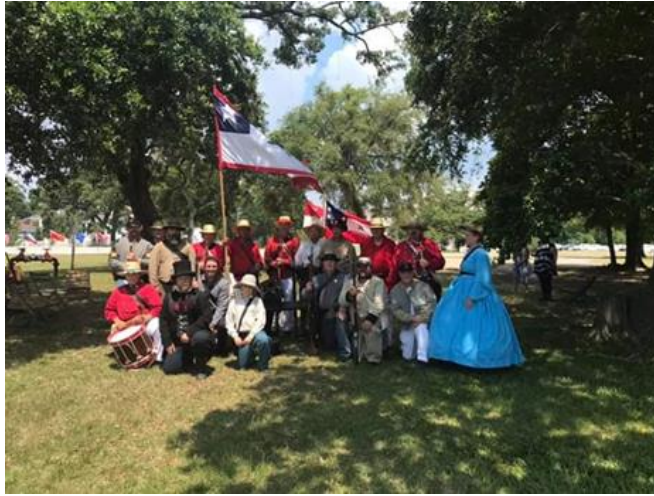
Camp Members fell in with the 3 rd Miss. Inf. and took a photo around 7 Stars Artillery piece.