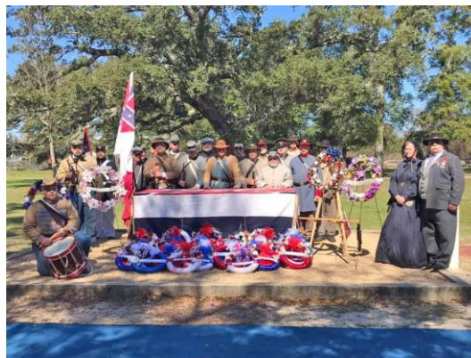
The participants all took a photo around the Tomb of the Unknown Soldier after the Ceremony.