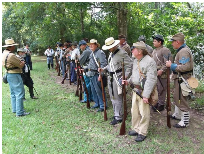
The Shieldsboro Rifles took this photo before the battle and were joined by the Gaines Warriors.