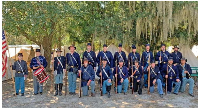
The 3 rd Mississippi Infantry formed up as the 9 th Connecticut Infantry on Sunday to keep the numbers equal.