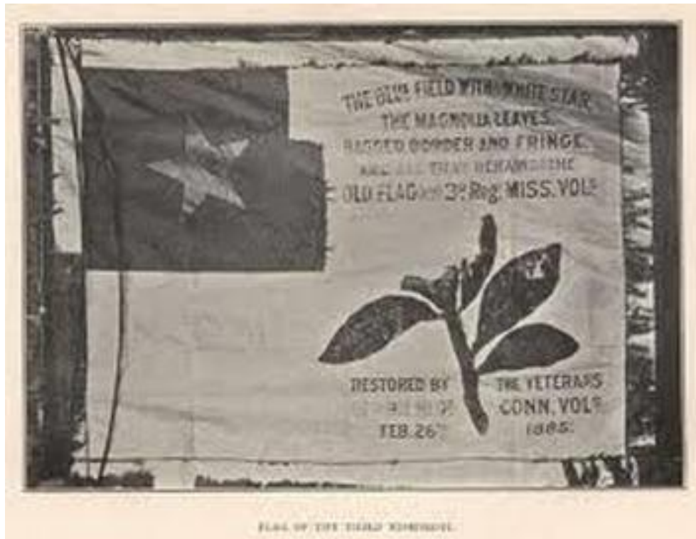
Regimental Flag of the 3 rd Mississippi Infantry