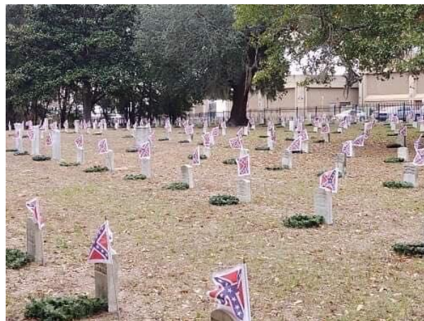
The wreaths were all laid at each grave in the Cemetery for the program on Saturday December 7, 2019.