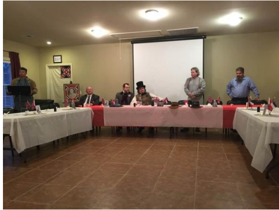
Camp #2263 held its 5 th Annual Lee-Jackson Banquet on Saturday January 18, 2020.