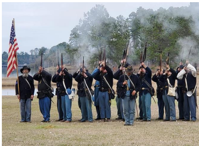
The 9 th Connecticut Infantry fires a volley after the battle on Sunday February 23, 2020.