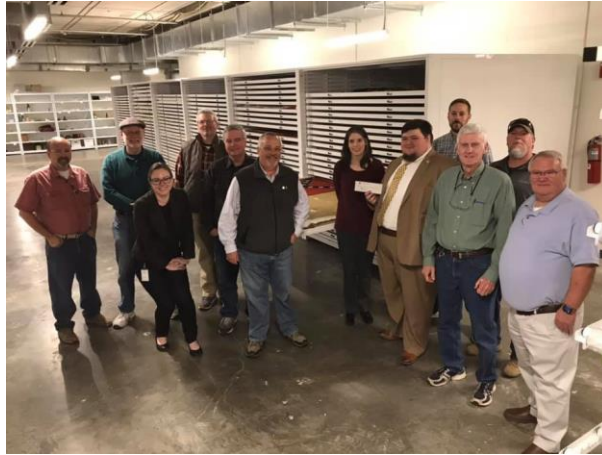
Mississippi Division Officers toured the Confederate Flags Archives at the Old Capital Building.