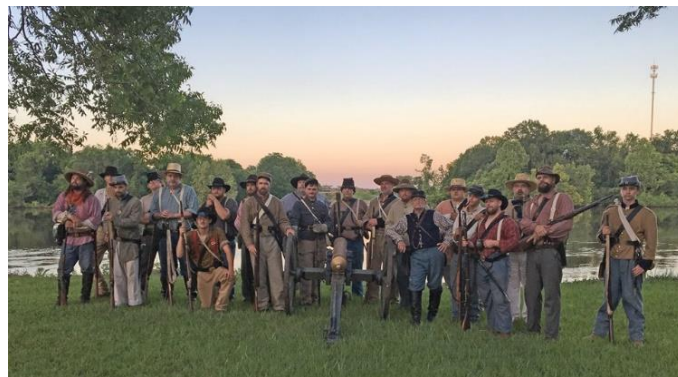
The Confederates took this photo by the river on Saturday June 8 in Harrisonburg, LA right at dark.