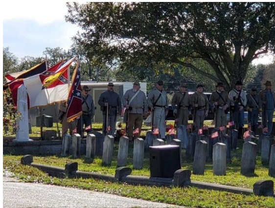
The Memorial was held at the Magnolia Cemetery and supported by members of the Gulf Coast Battalion.