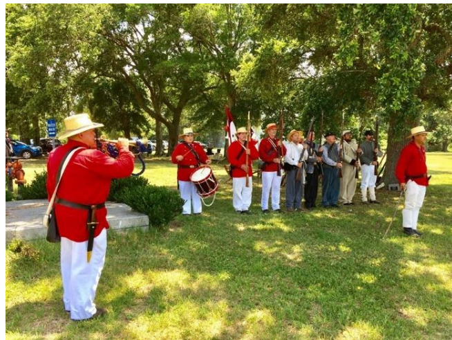
The 3 rd Mississippi Infantry presented arms after 3 volleys in honor of President Davis at Beauvoir.