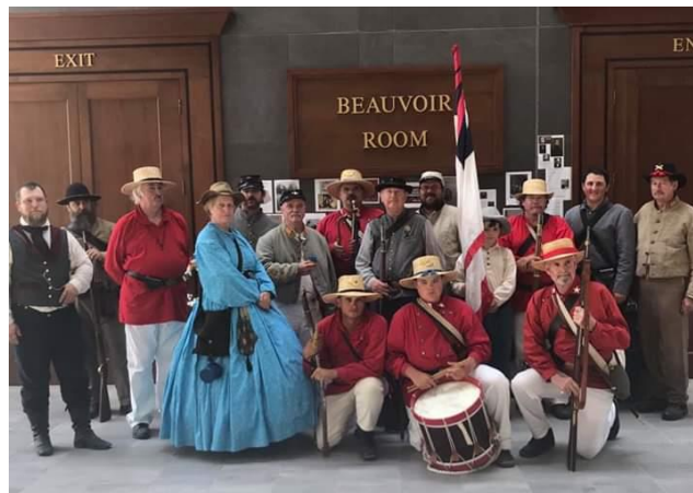
Camp Members attended and posed for this photo with the other participants inside the JDPL.