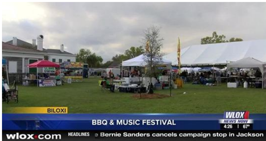
WLOX promoted and covered the Barbashela Music Festival held for the 3 rd year in a row at Beauvoir.