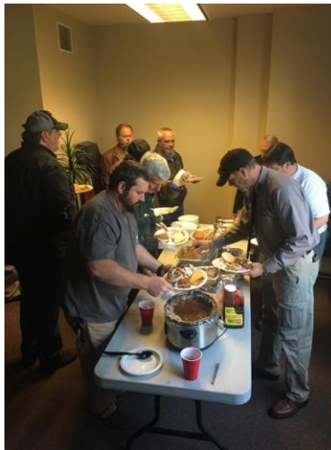
Division Members enjoy a lunch at the Division Workshop on February 29, 2020.