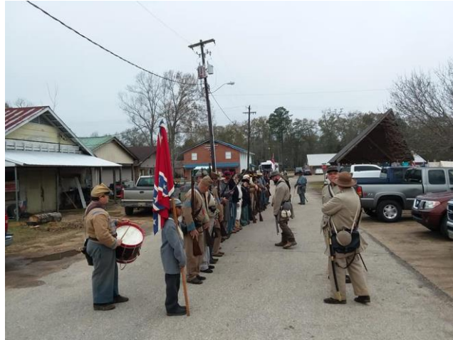
Camp Members form up with the 3 rd Miss Inf in Leakesville on December 14, 2019.