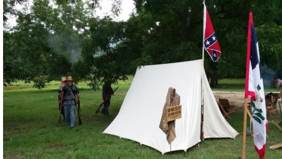
The Shieldsboro Rifles Memers set up an encampment and Living History at Cowpen Creek Farm near.