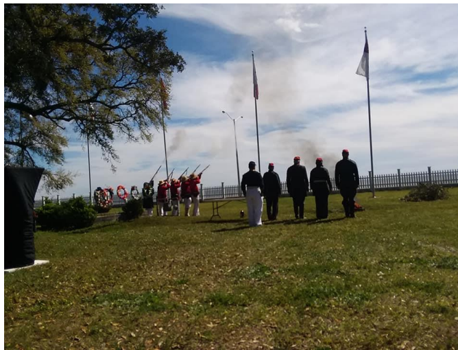
Camp Members helped make up the honor guards to fire volleys at the flags up front of Beauvoir.