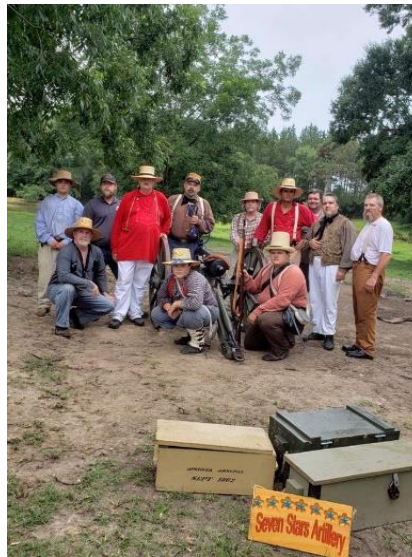
Camp Members and participants all took a photo around the cannon at the Cowpen Creek event .