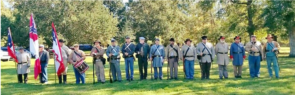
Camp Members posed for this photo as part of the Honor Guard for the Oddfellows Pilgrimage Ceremony.