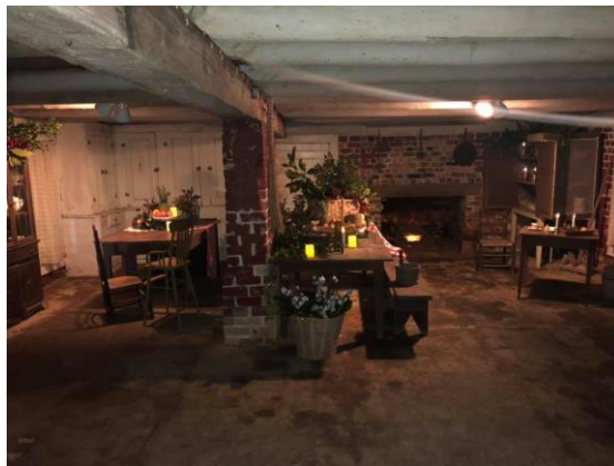
The basemant of the John Ford Home was decorated for Christmas for the annual Candlelight Celebration.