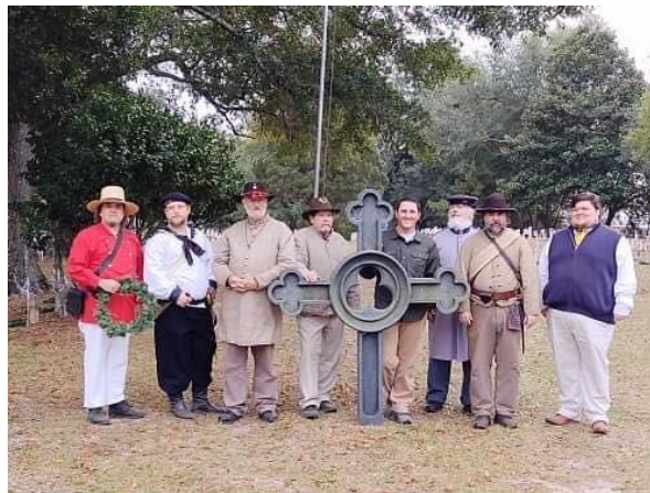
Camp Members and Associates take a photo with Commander Bond in the Beauvoir Cemetery at the cross.