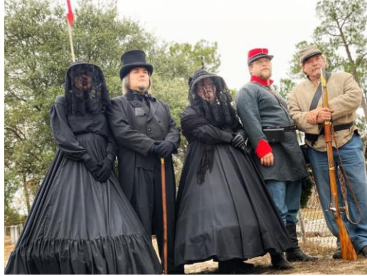
Camp Officers participated in the Rotten Wreaths Program in Diamondhead on Saturday December 14, 2019.