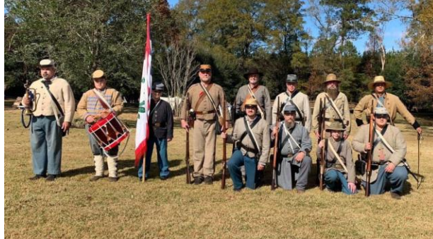
The Shieldsboro Rifles, who actually trained at Camp Moore, posed for a pic on Saturday November 23, 2019.