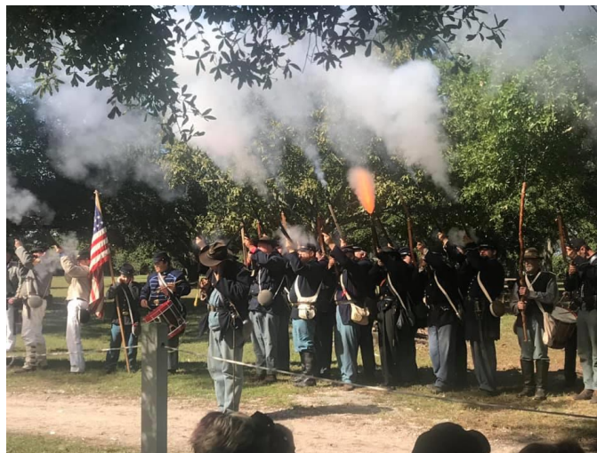
The 9 th Conn Inf fired a volley at the end of the battle on Sunday October 20, 2019 at Beauvoir.