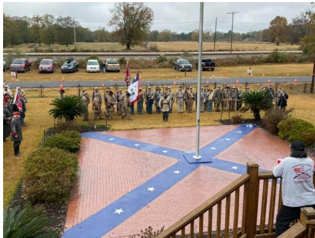
The 3 rd Mississippi Infantry formed for flag raising at the Camp Moore Museum during the annual event.