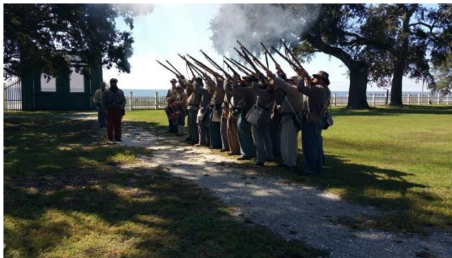
The 3 rd Mississippi Infantry fired a volley to dedicate the Traveler Headstone on Saturday at Fall Muster.