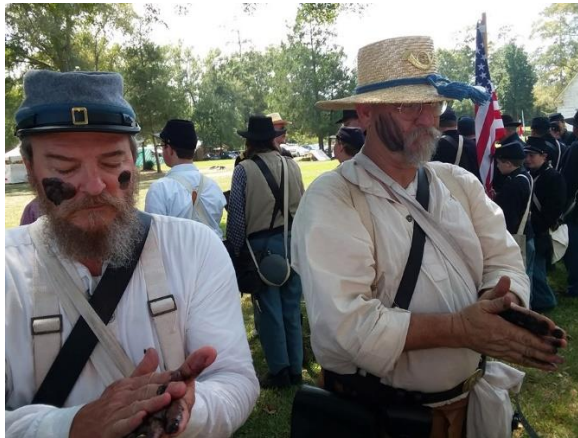
New recruits to the 3 rd Miss Inf were marked as fresh fish at the JFH Event in Sandy Hook, MS.