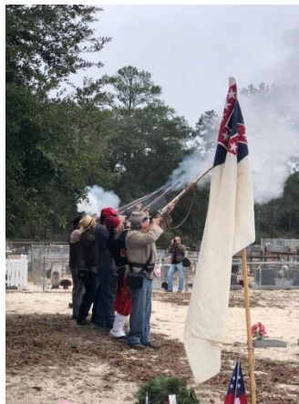
Camp Members for a volley in honor of all the Soldiers buried in Rotten Bayou Cemetery.