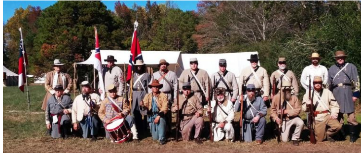
Camp Members participated in the Battles for the Armory Reenactment at Tallassee, AL November 8-10.