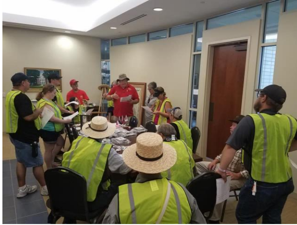
Camp Members who volunteered were given judging requirements before the Coastfest event at Beauvoir.