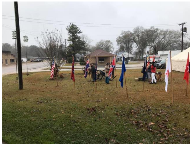
Flags are flown in downtown Leakesville in honor of the McLeod's Mill Reenactment.