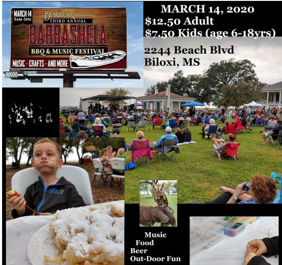
Beauvoir held its annual Music Festival on Saturday March 14, 2020 on the event lawn up front.