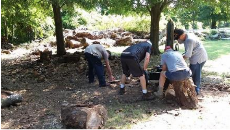
The Shieldsboro Rifles had members help at Beauvoir's first Fall Muster Workday on August 10, 2019.