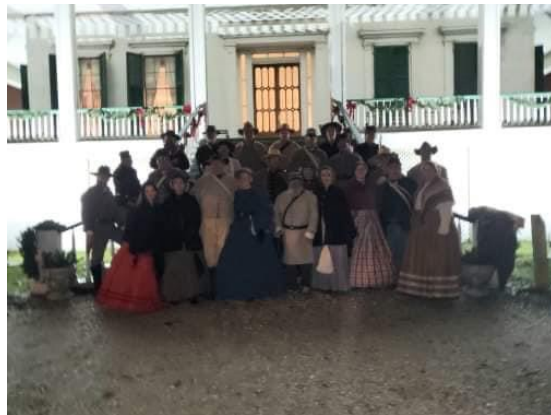
Camps Members pose for a photo at Christmas in Camp in front of the mansion.