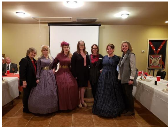
The Division OCR Officers posed for this picture with the new OCR #30 Members at the Lee-Jackson Banquet.