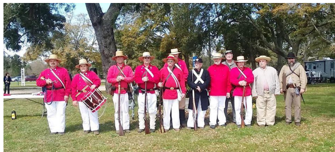
The 3 rd Mississippi Infantry & 7 Stars Artillery posed for this photo after Confederate Flag Day.