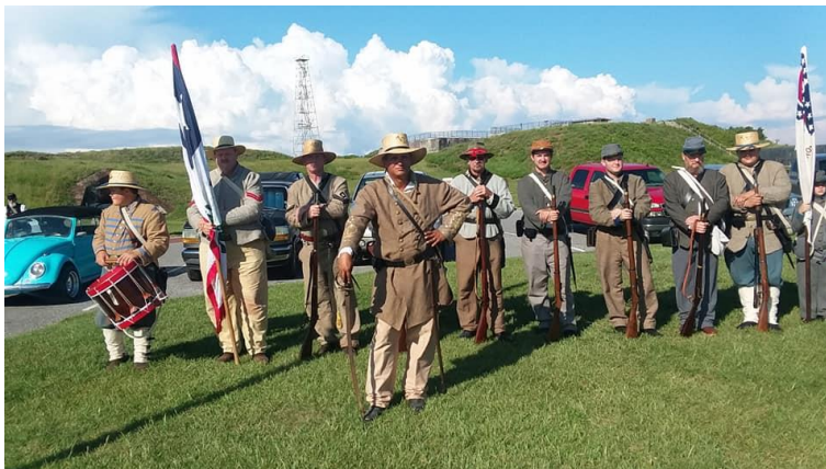
The 3 rd Mississippi Infantry was prepared to present arms at flag raising at the Fort on Aug. 3, 2019.