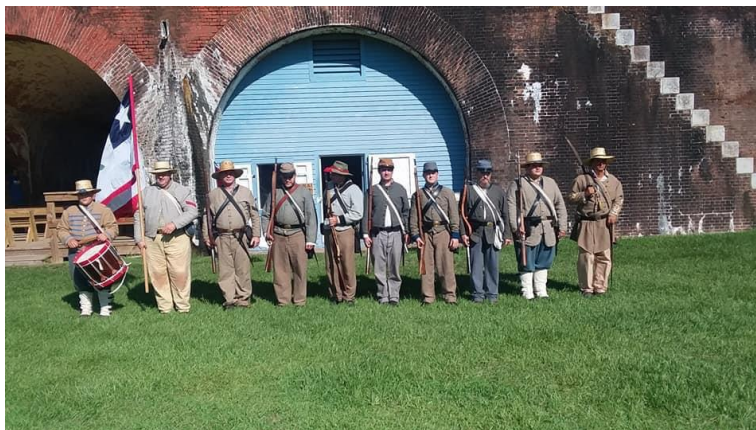
The Shieldsboro Rifles took this photo in front of the Officer's Barracks at Fort Morgan inside the fort.