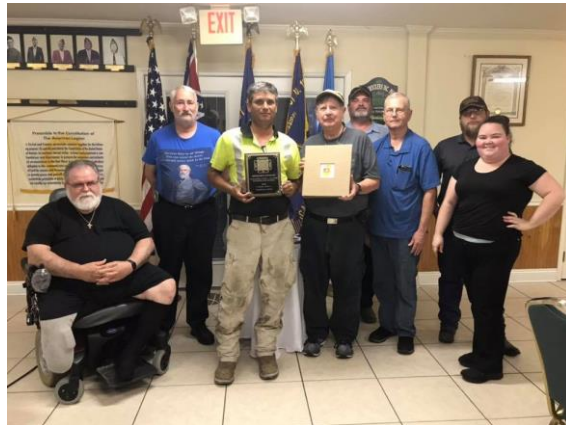
The Camp Members took a photo with the Camp Scrapbook and the Award after the monthly meeting.