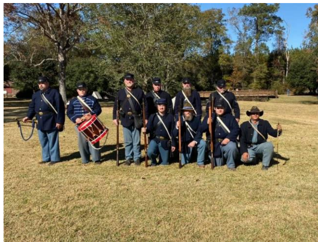
The 3 rd Miss Inf had to portray the 9 th Connecticut Infantry on Sunday November 24, 2019 at Camp Moore.