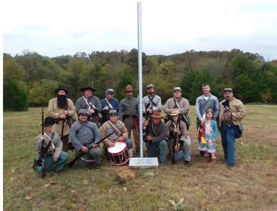
The 3 rd Mississippi Infantry joined the 15 th Mississippi Infantry at the Colonel Forrest Memorial Historic Site.