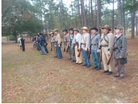
The reenactors line up for a photo at the DeFuniak Springs event on Sunday January 26, 2020.