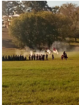
The battle rages on as the Confederates are being pushed by the Yankee Cavalry as they descend down the hill.